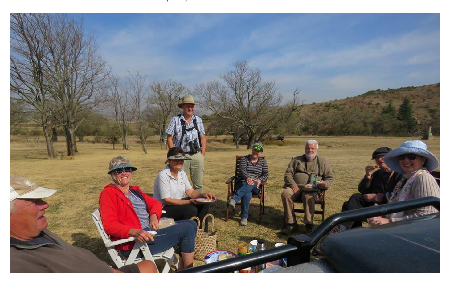
Smiles all round